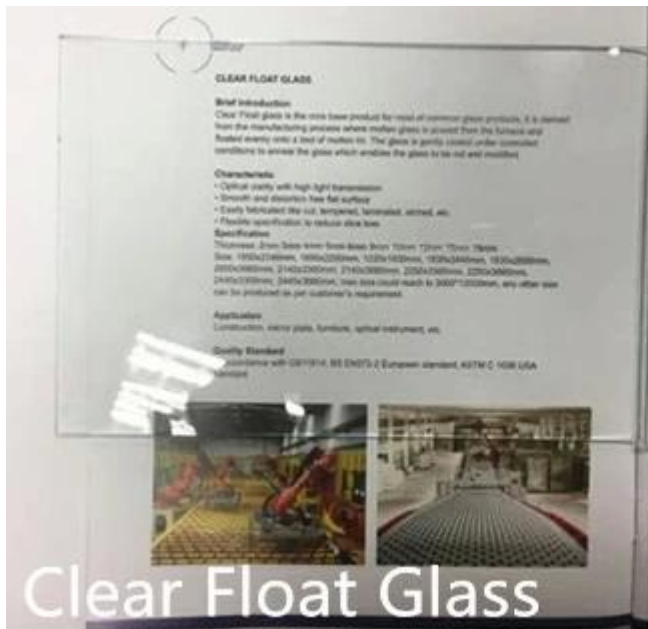
Clear Float Glass