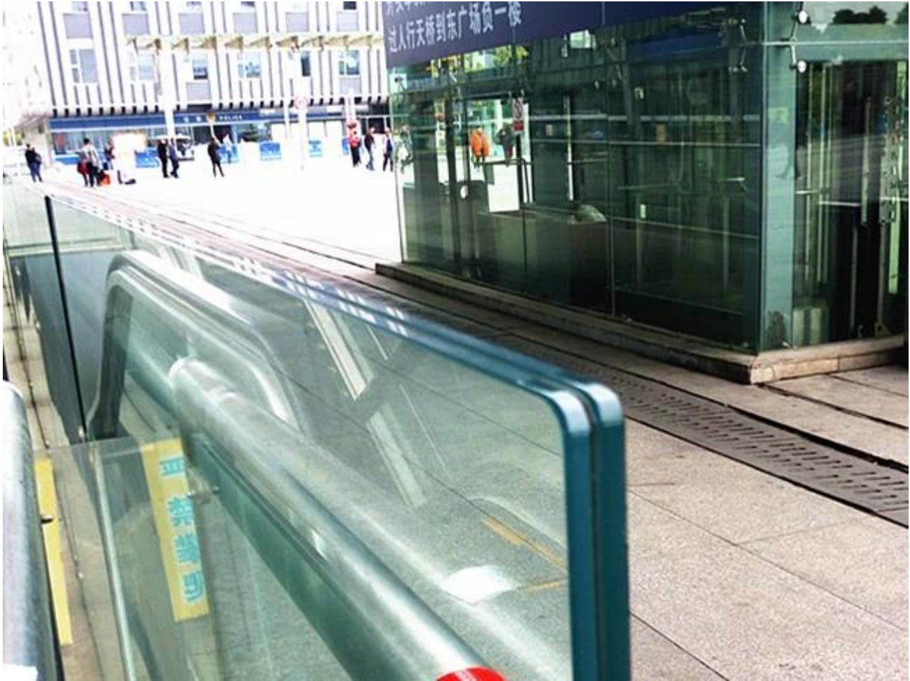
13.14mm Clear PVB Laminated Glass Use For Canopy: