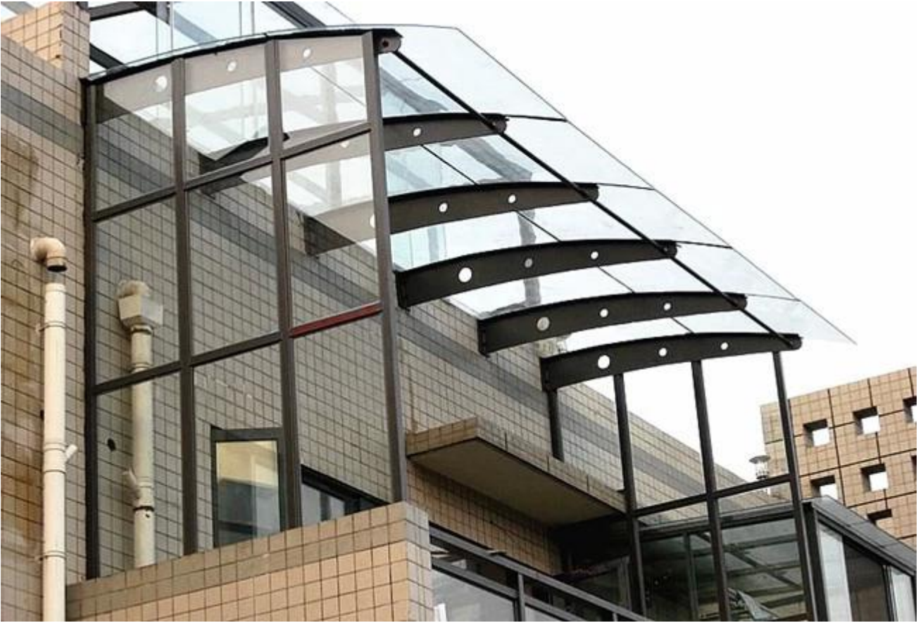
JIMY Factory Laminated Glass Warehouse: