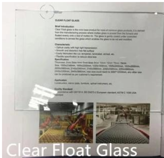
Clear Float Glass