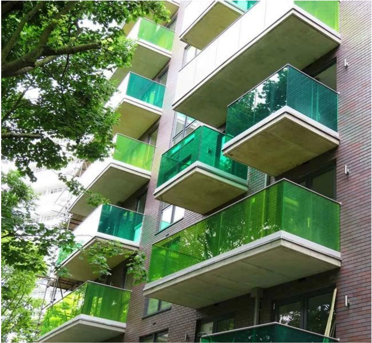
Processing Tempered Laminated Glass with Holes and Cutouts