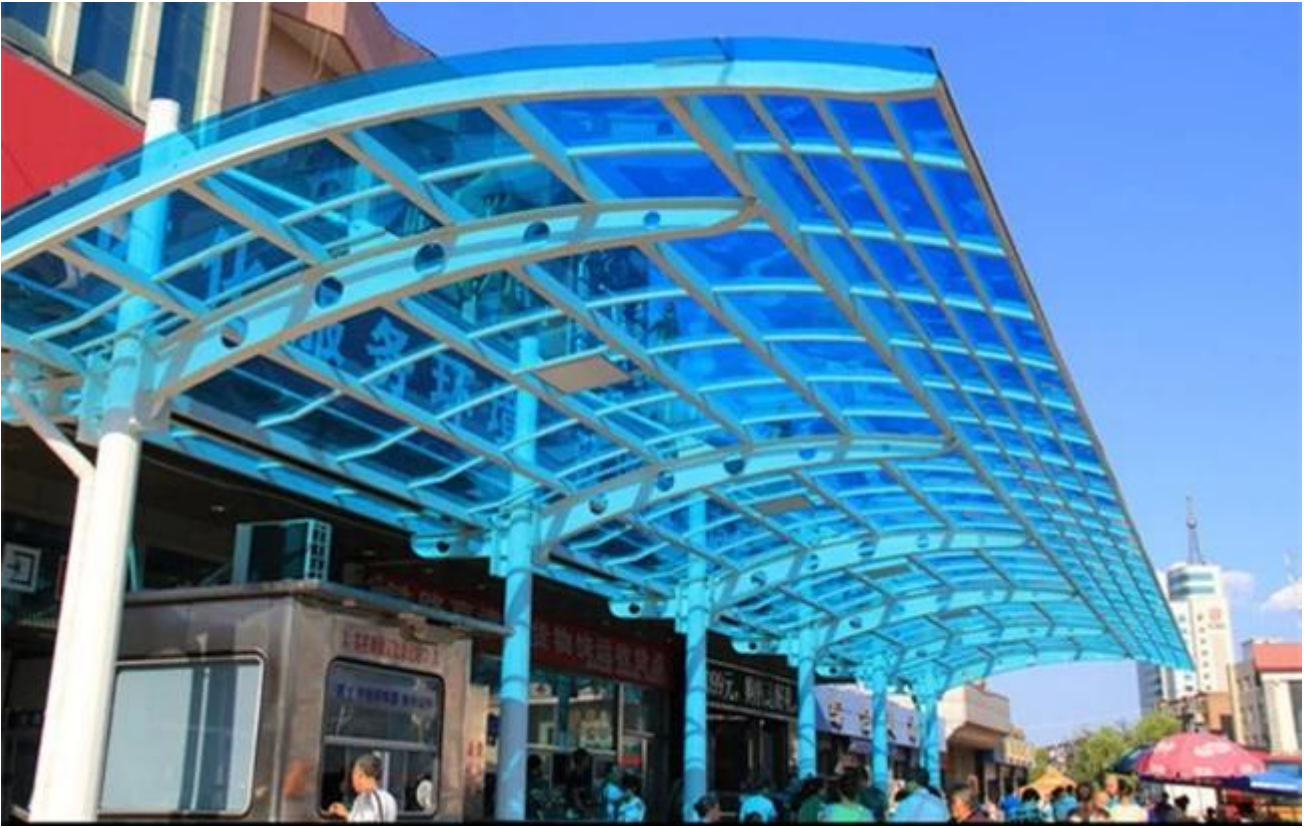
17.52mm green colored tempered laminated glass balconies