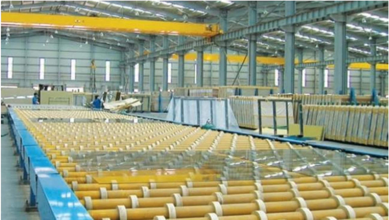
Float Glass Packaging