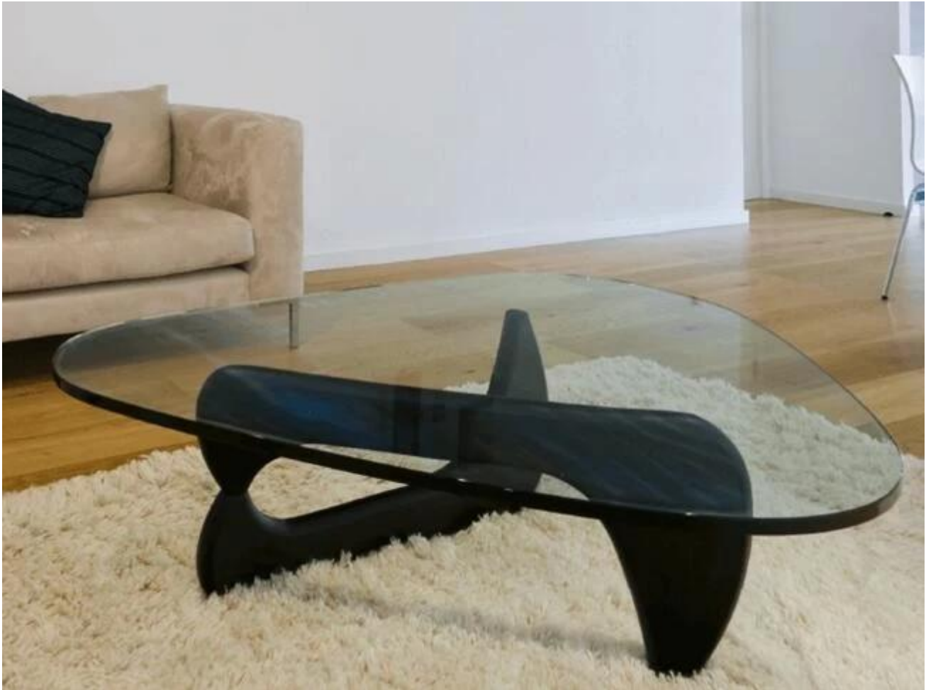
Patio Table Top Glass