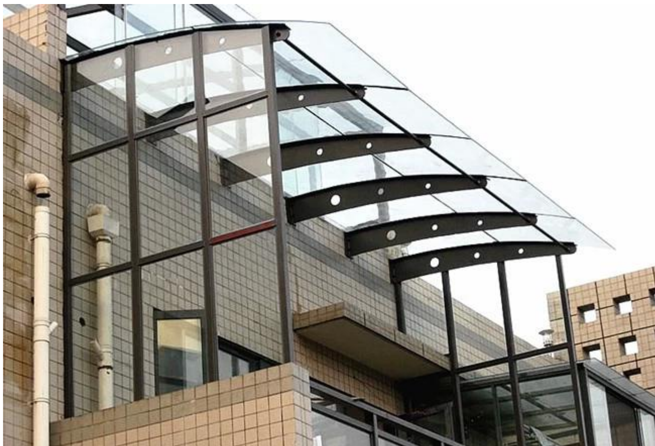
JIMY Factory Laminated Glass Warehouse: