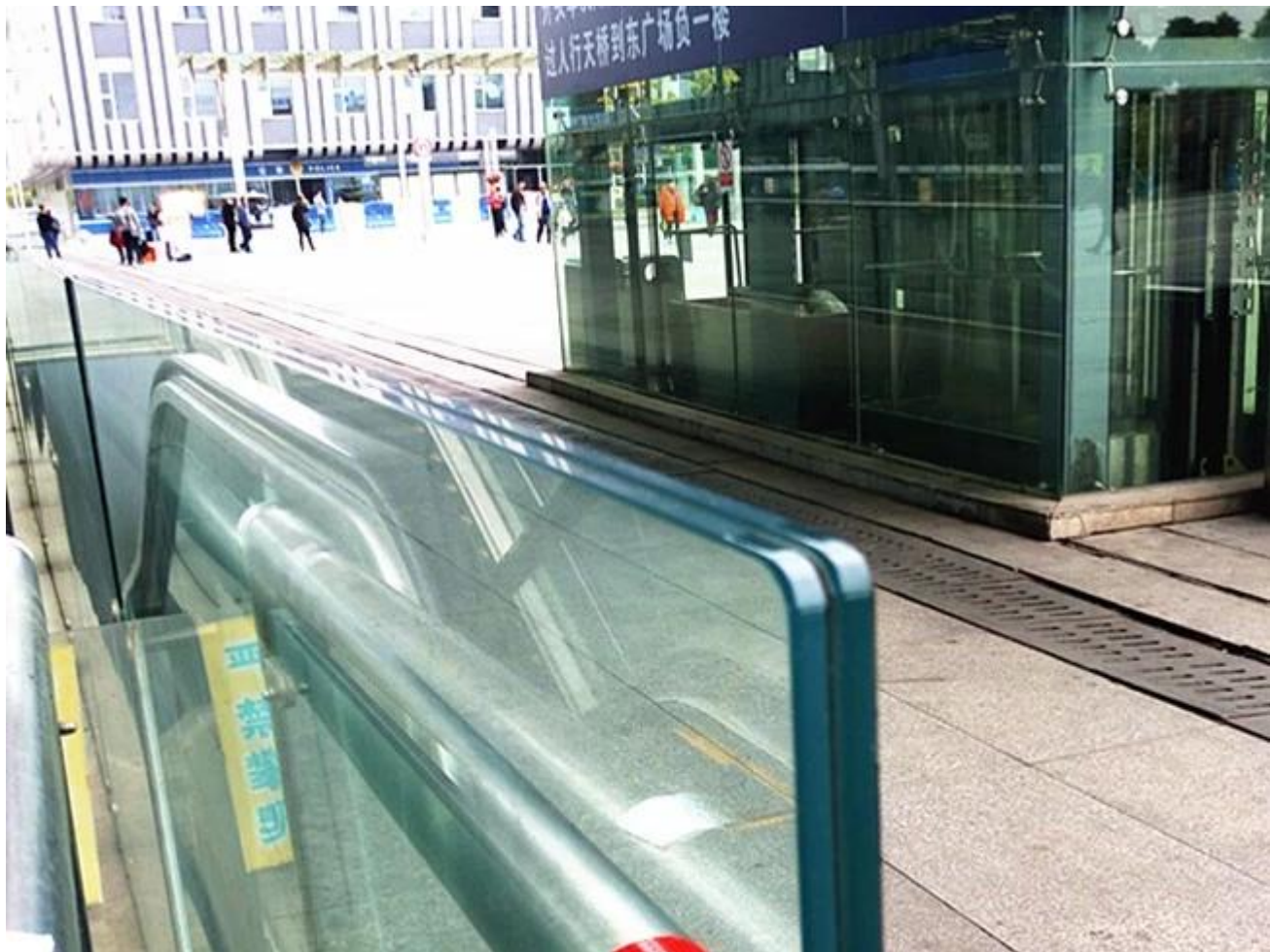
13.14mm Clear PVB Laminated Glass Use For Canopy: