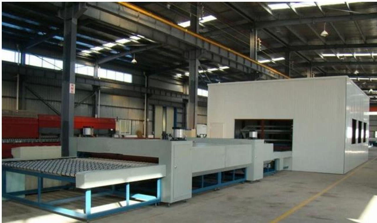
Laminated Glass Autoclave