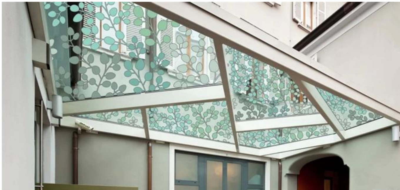
6+6mm transparent silk screen printed laminated glass for partition