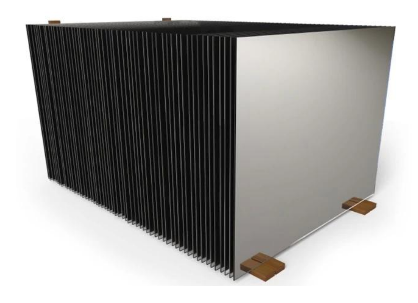
Mirror Glass Production Line