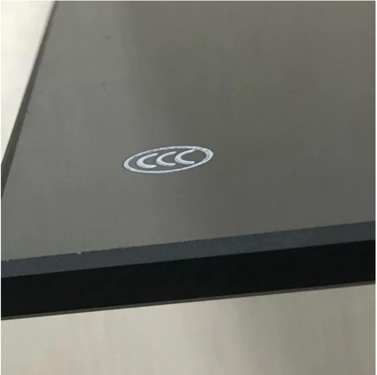
Tempered glass strong packing and safety loading