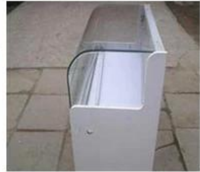
Bent glass factory and safety loading