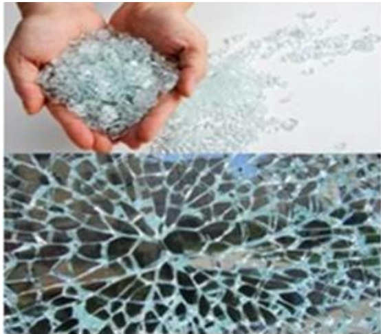
Toughened Glass broken into alveolate granules is human harmless