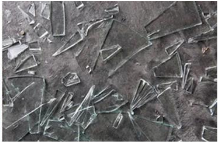
Annealed Glass when broken into sharp, easy to hurt human