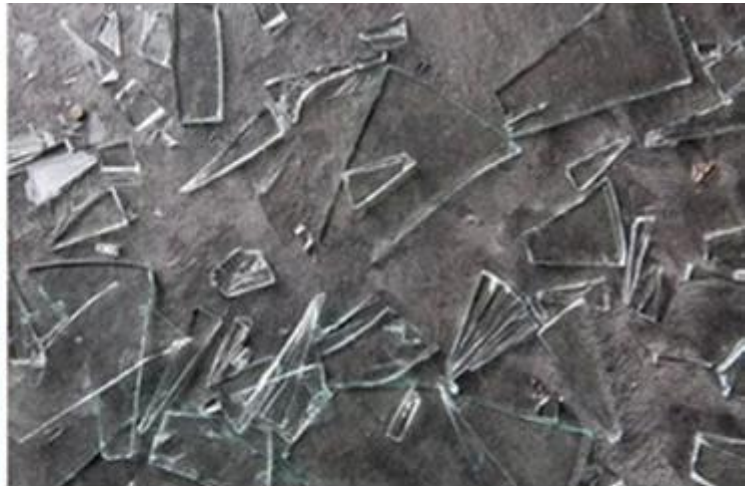
Annealed Glass when broken into sharp,easy to hurt human