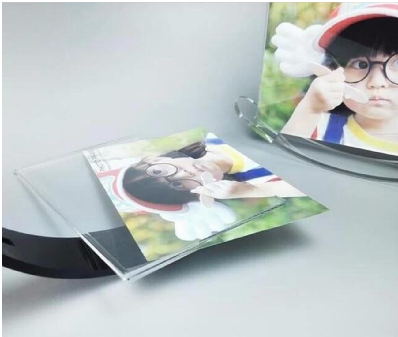
Personalized clear glass picture frames wholesaler