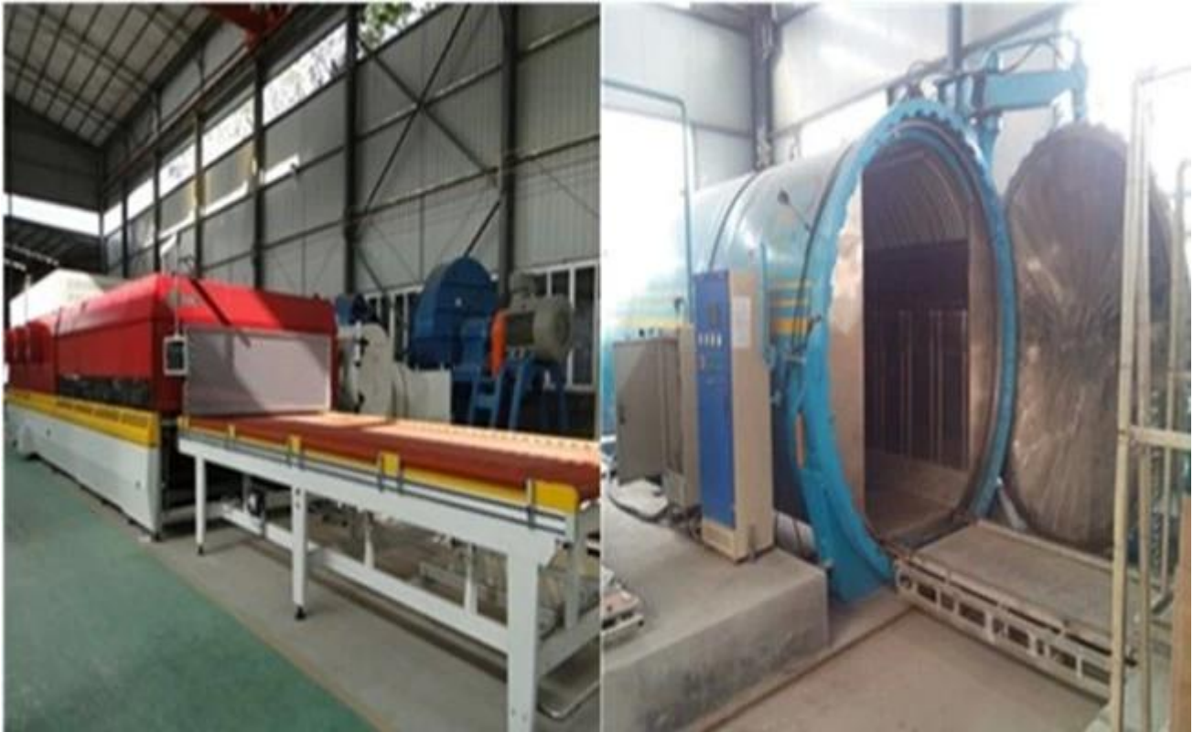
Strong package of HST glass