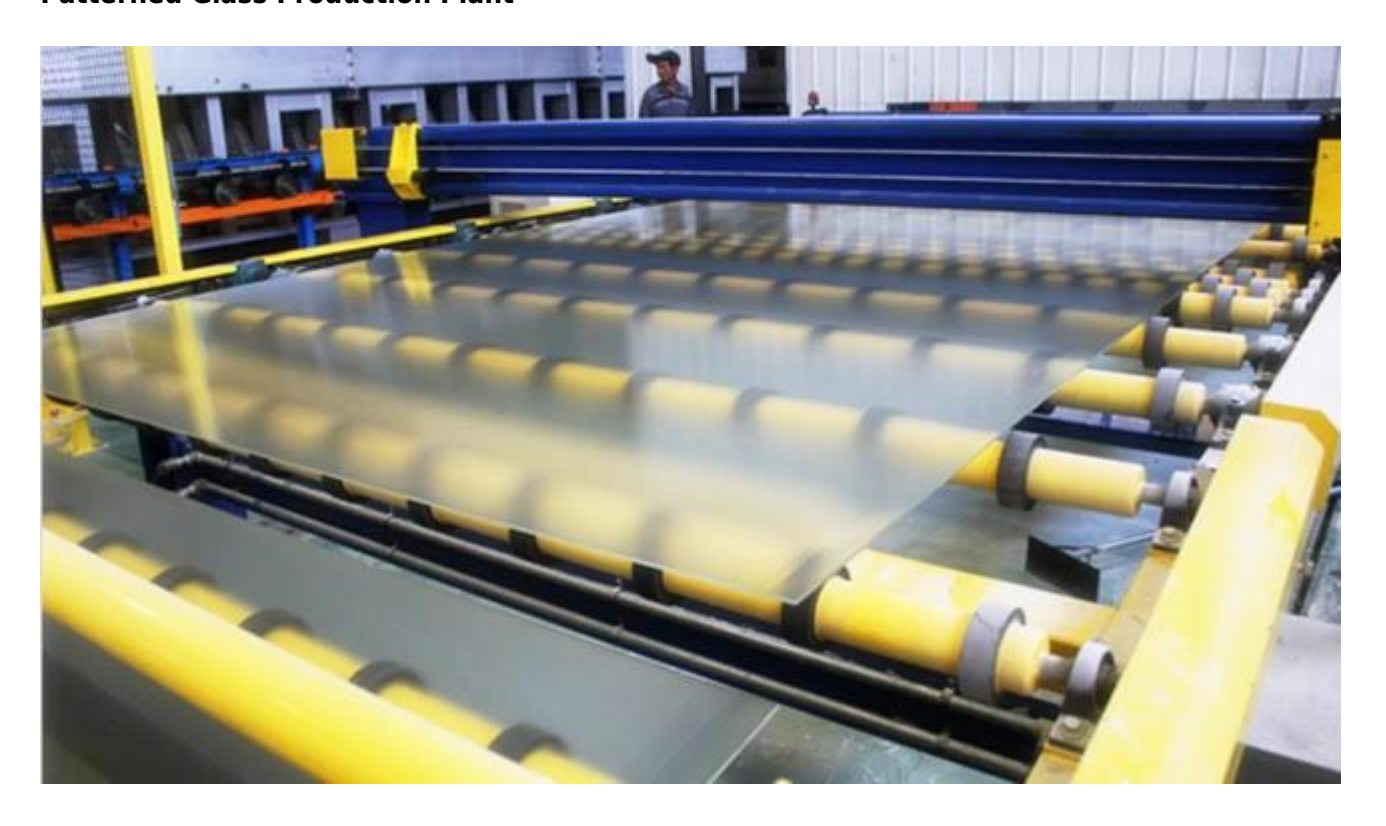
Glass Strong Packing