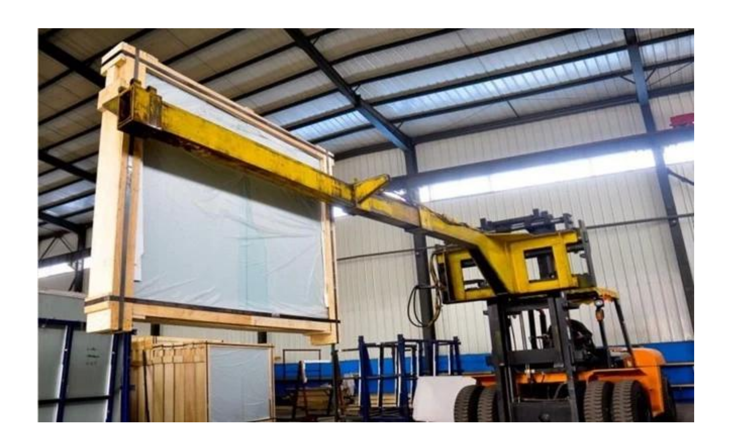
Glass Safety Loading