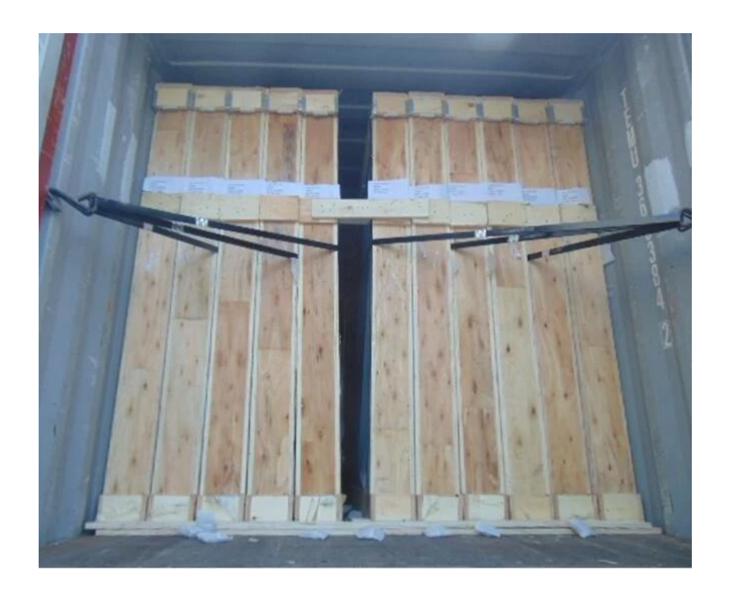
5MM Low Iron Float Glass For Greenhouse