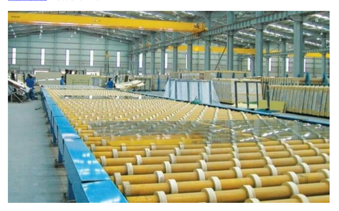
China Float Glass Packaging