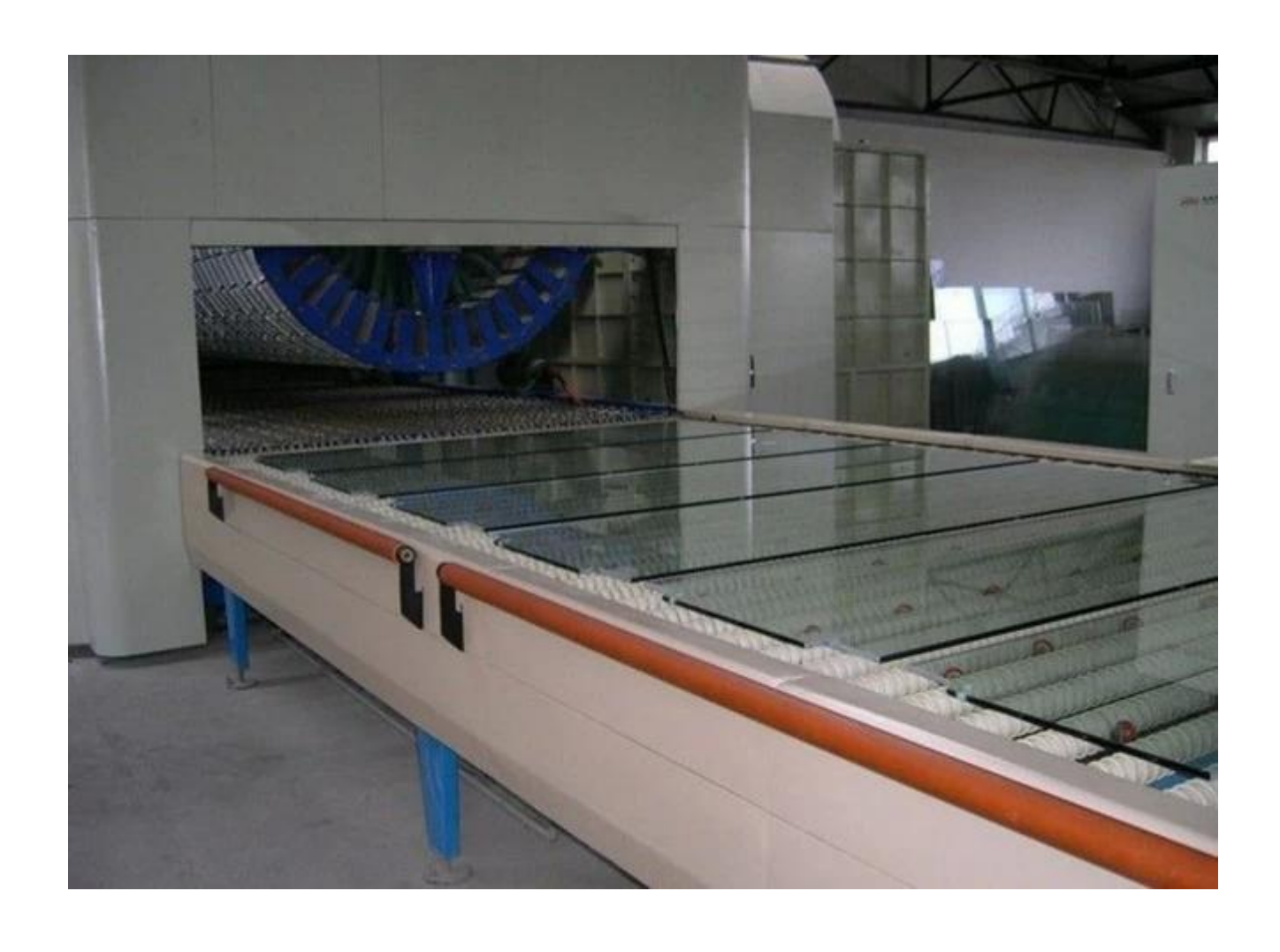
Canopy glass safety loading