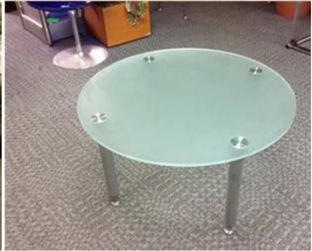
Edge and corner polished