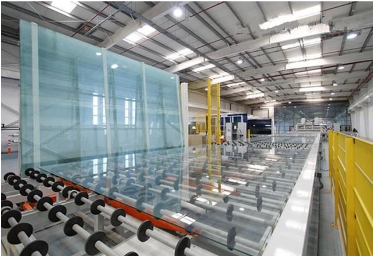
Float Glass Strong Wooden Crate Packing