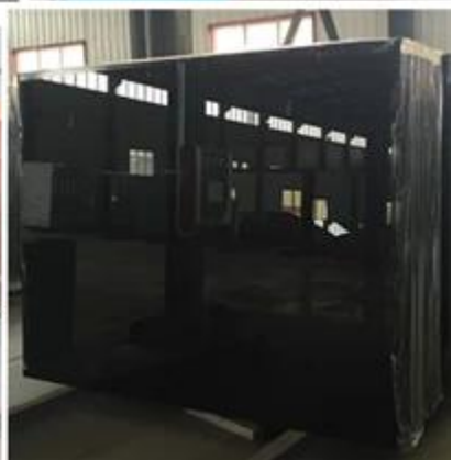
Lacquer Glass production and warehouse: