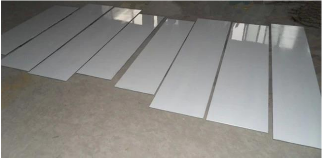
Different Colored Lacquer Glass: