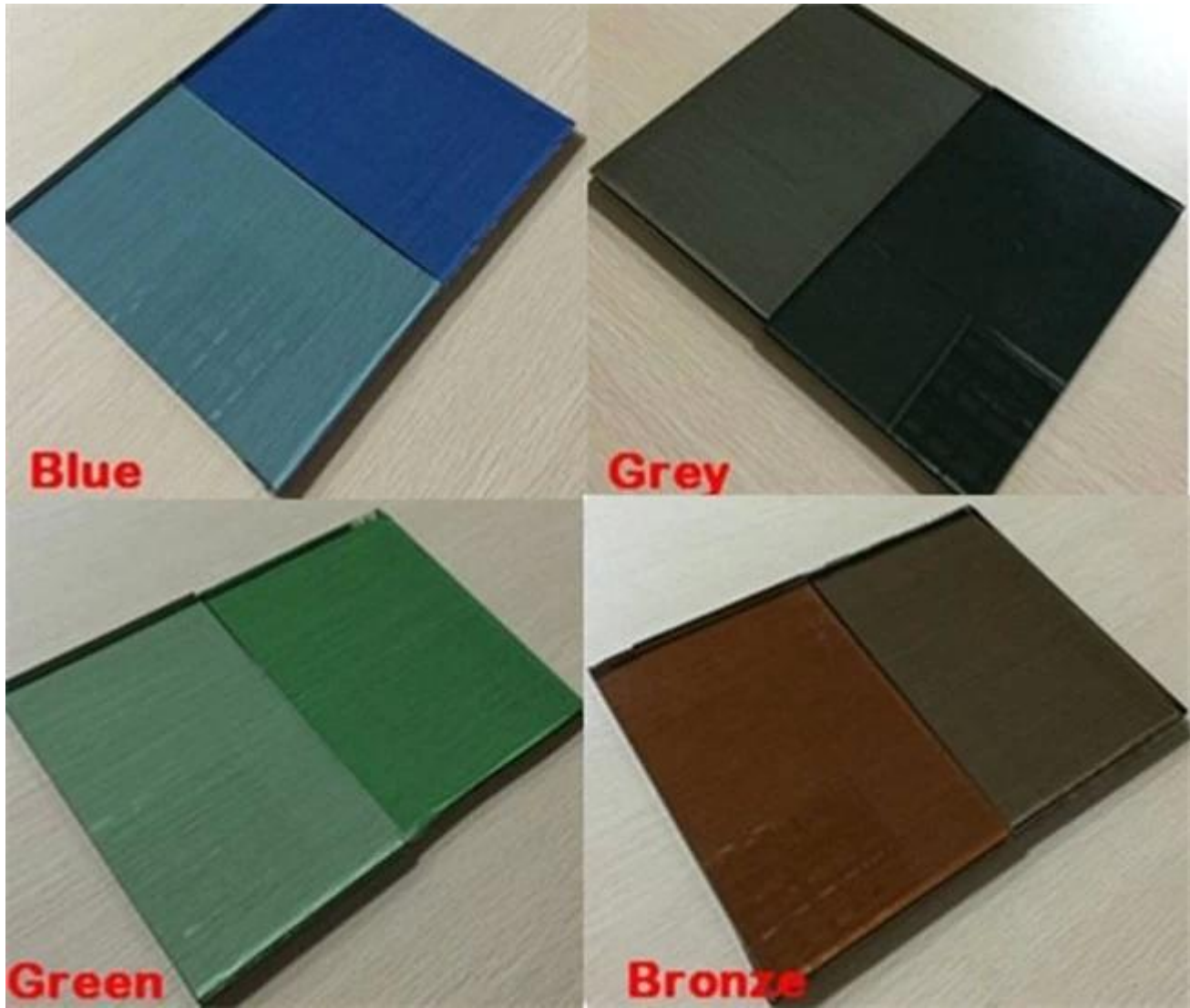
Safety loading for 8mm F-green tinted float glass