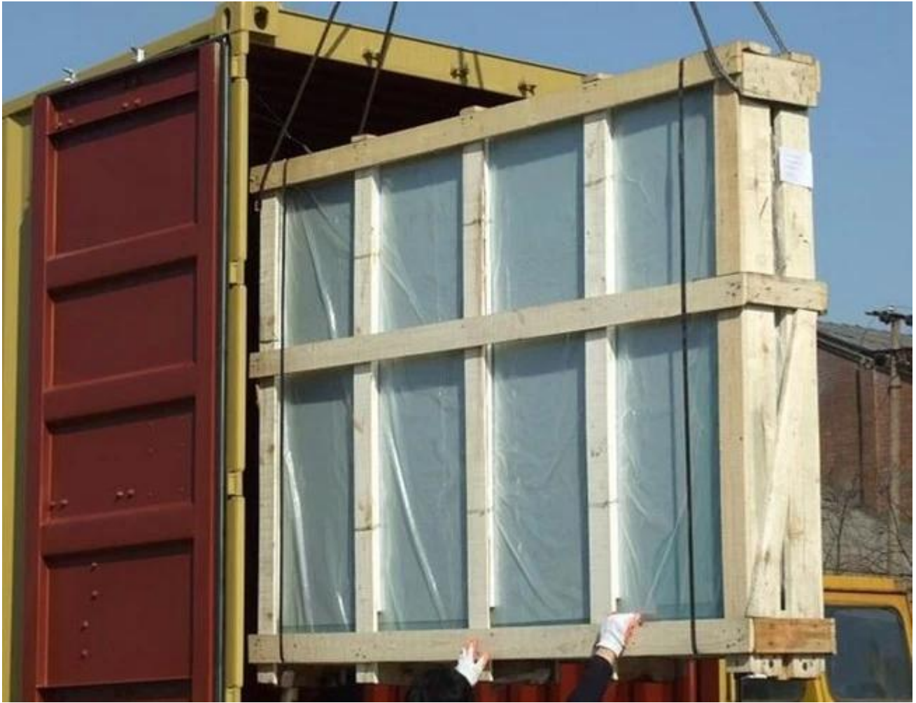
Factory show of SHENZHEN JIMY GLASS