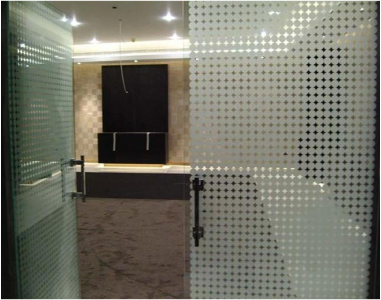
10mm acid etched tempered glass for living room sliding door :