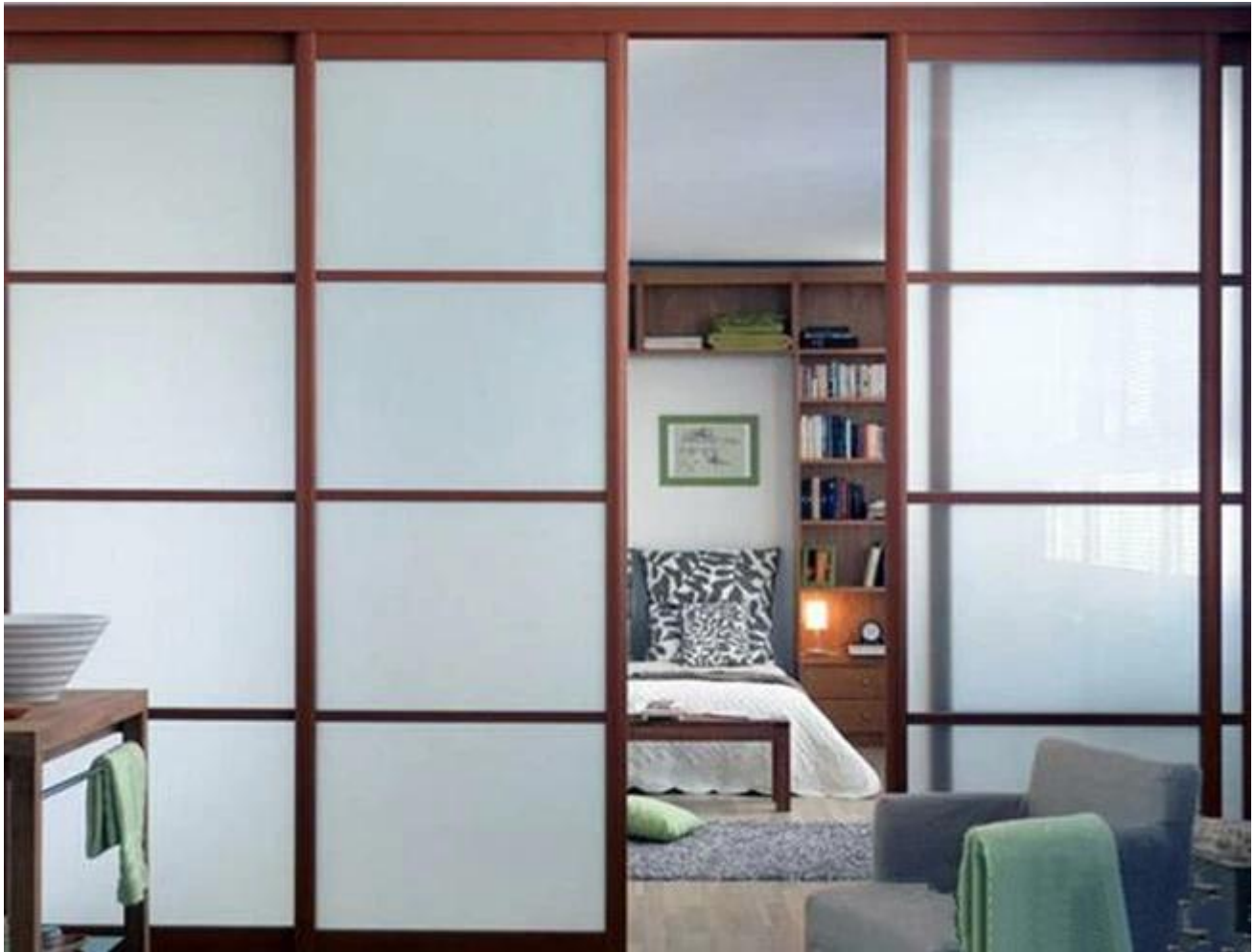
10mm Textures Frameless tempered glass for Entry door: