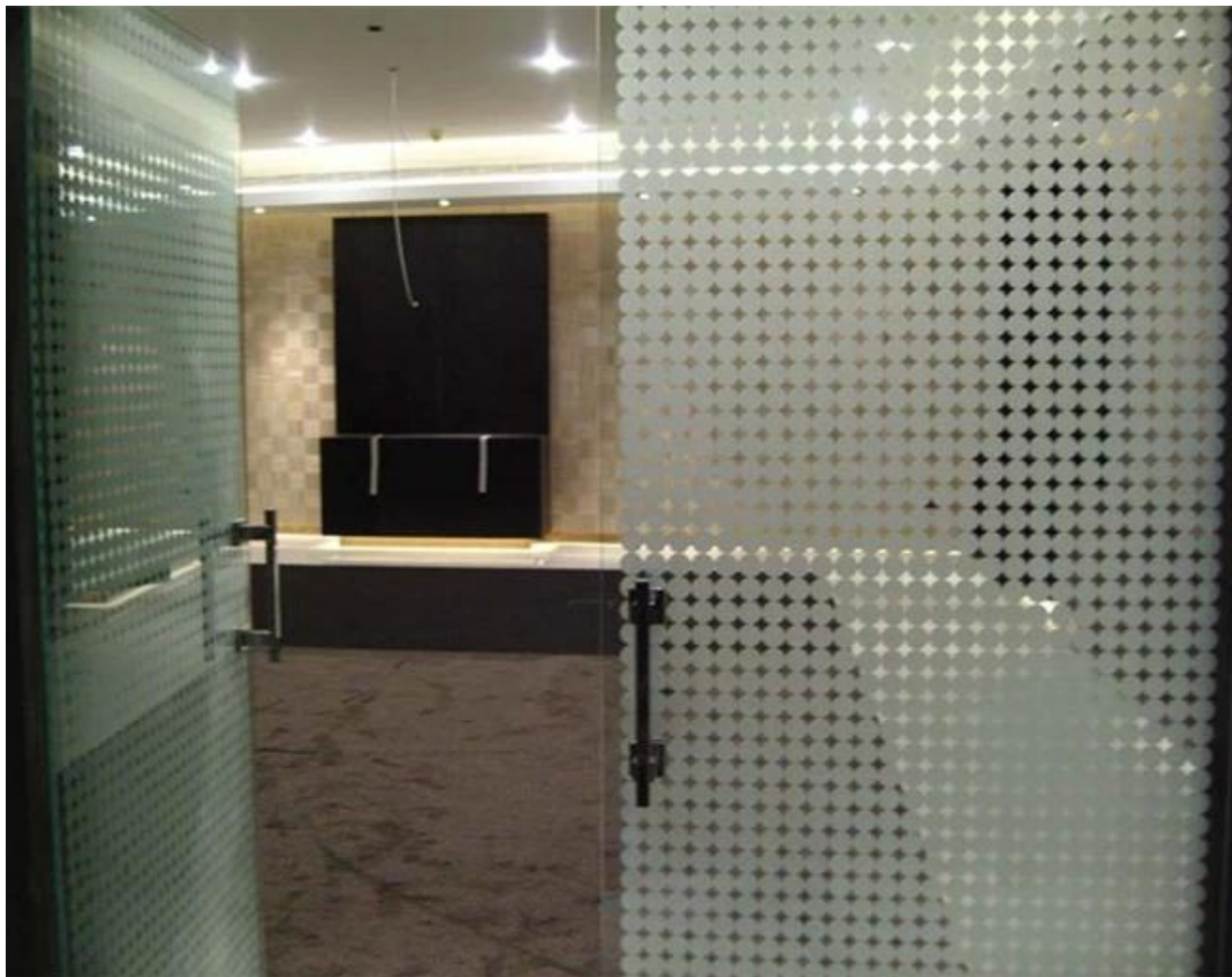
10mm acid etched tempered glass for living room sliding door :