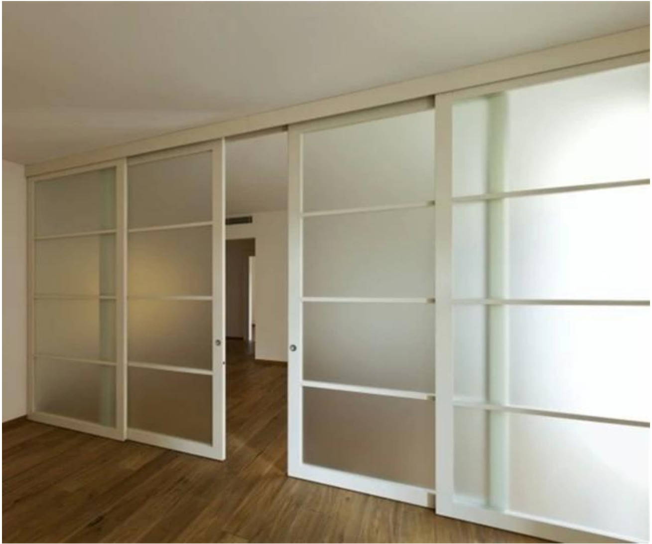
10mm frosted tempered glass for bedroom door :