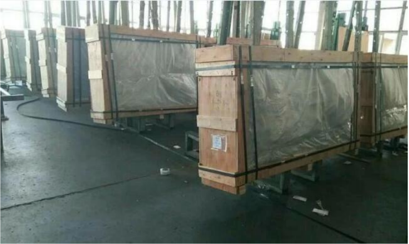
Loading the container by Jimy Glass Factory