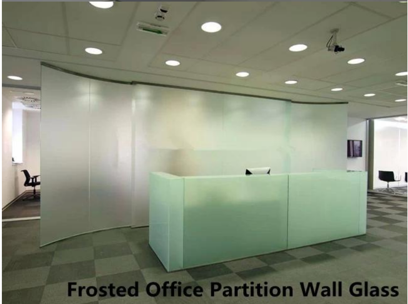
Frosted Office Partition Wall Glass