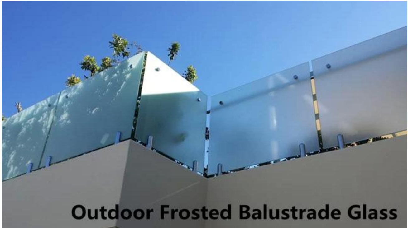
Outdoor Frosted Balustrade Glass