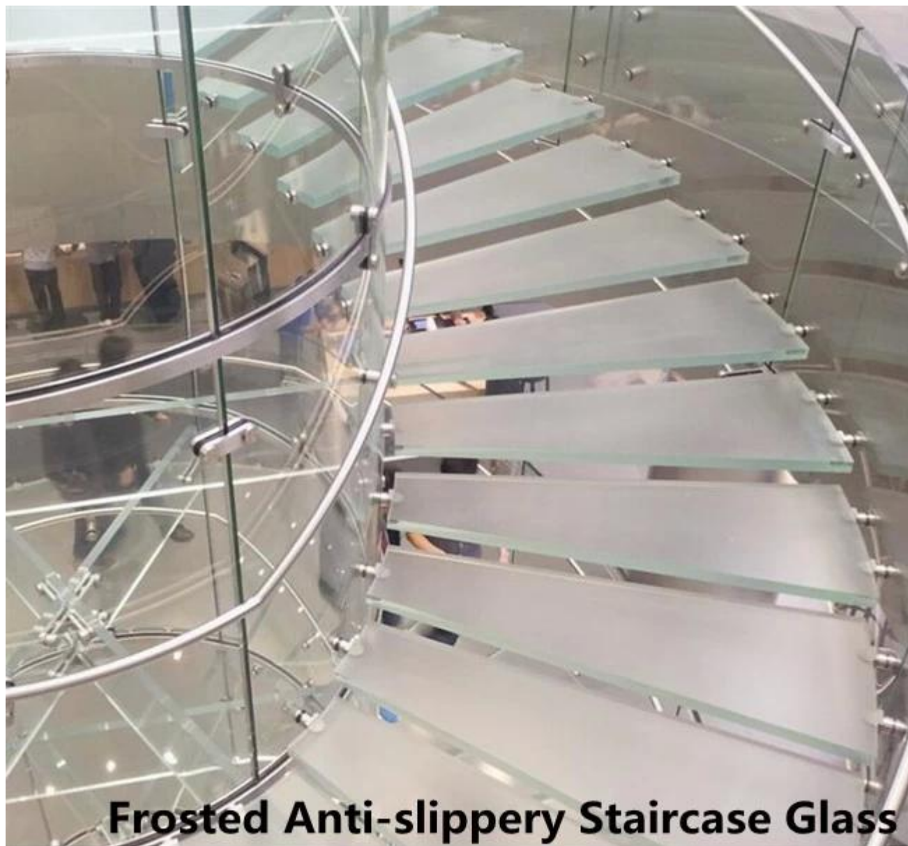
Frosted Anti-slippery Staircase Glass