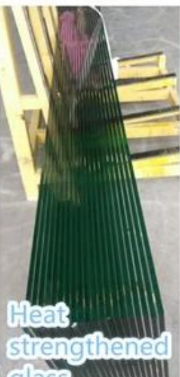
Heat strengthened glass