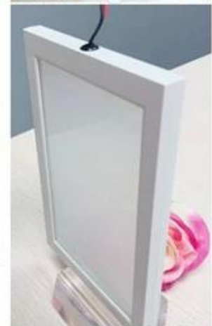
Smart PDLC glass