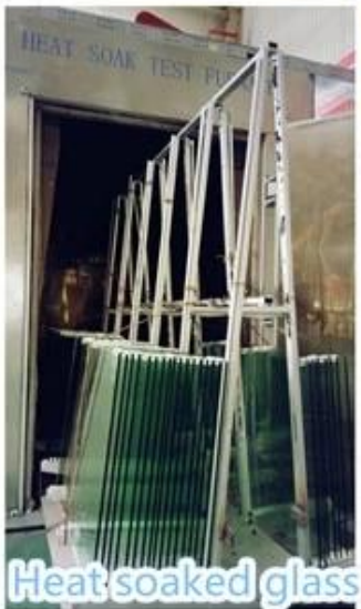
Heat soaked glass