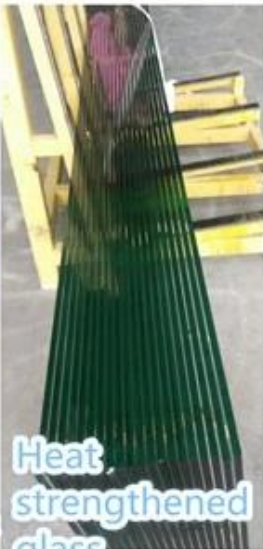
Heat strengthened glass