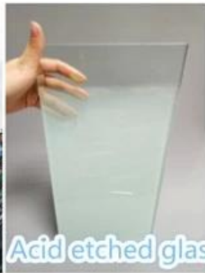
Acid etched glass