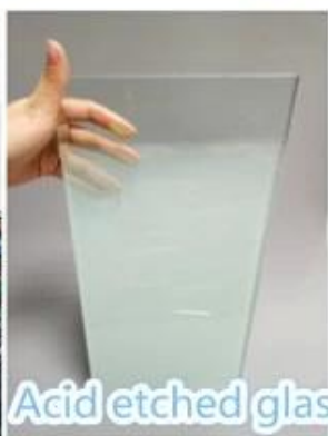
Acid etched glass