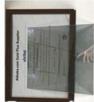
Two way mirror