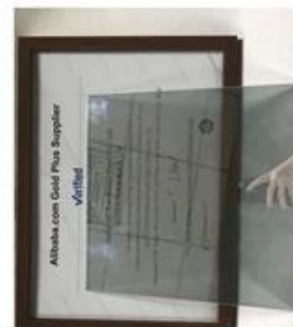
Two way mirror