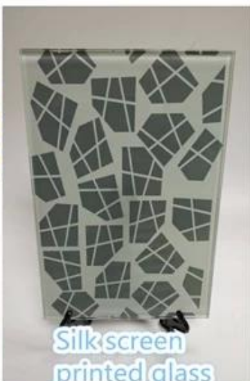
Silk screen printed glass