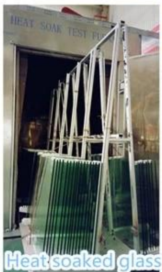
Heat soaked glass