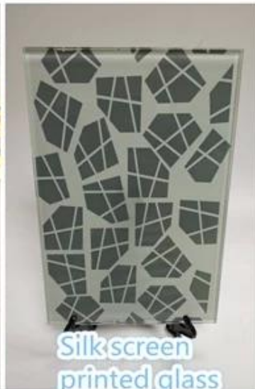
Silk screen printed glass