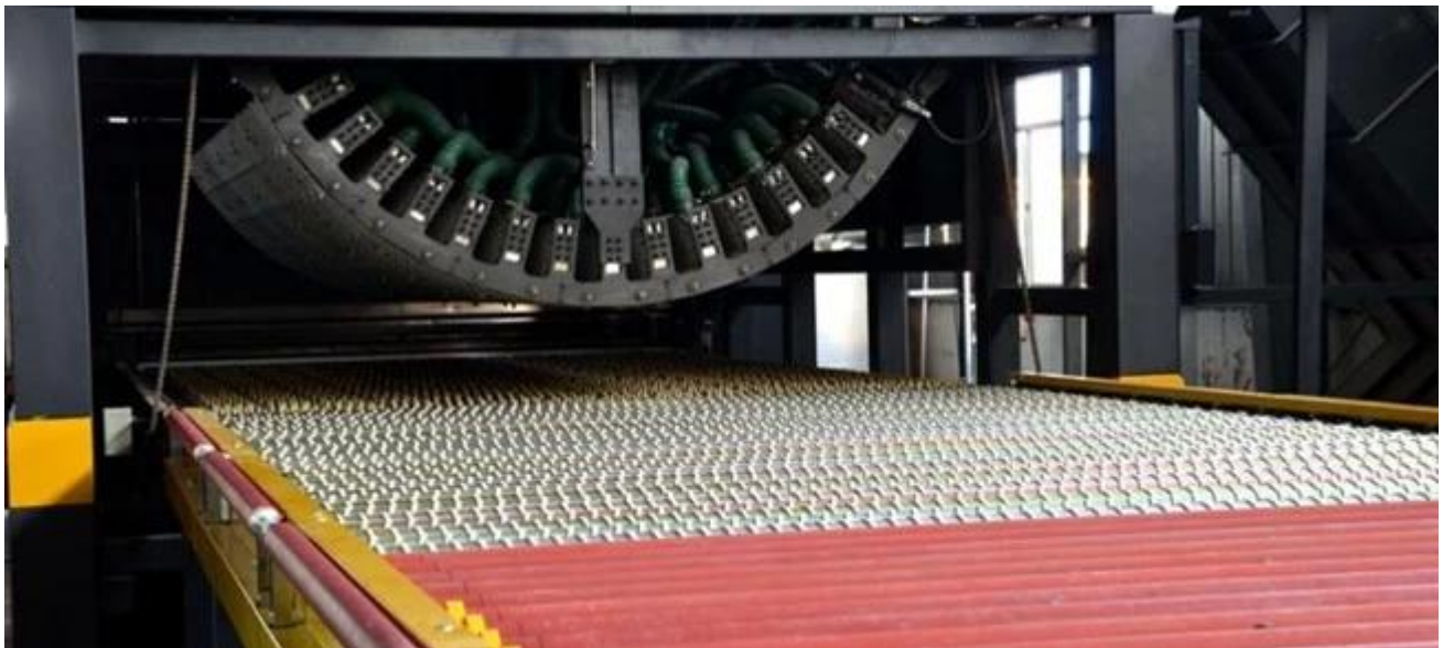
China Curved Glass Safety Loading