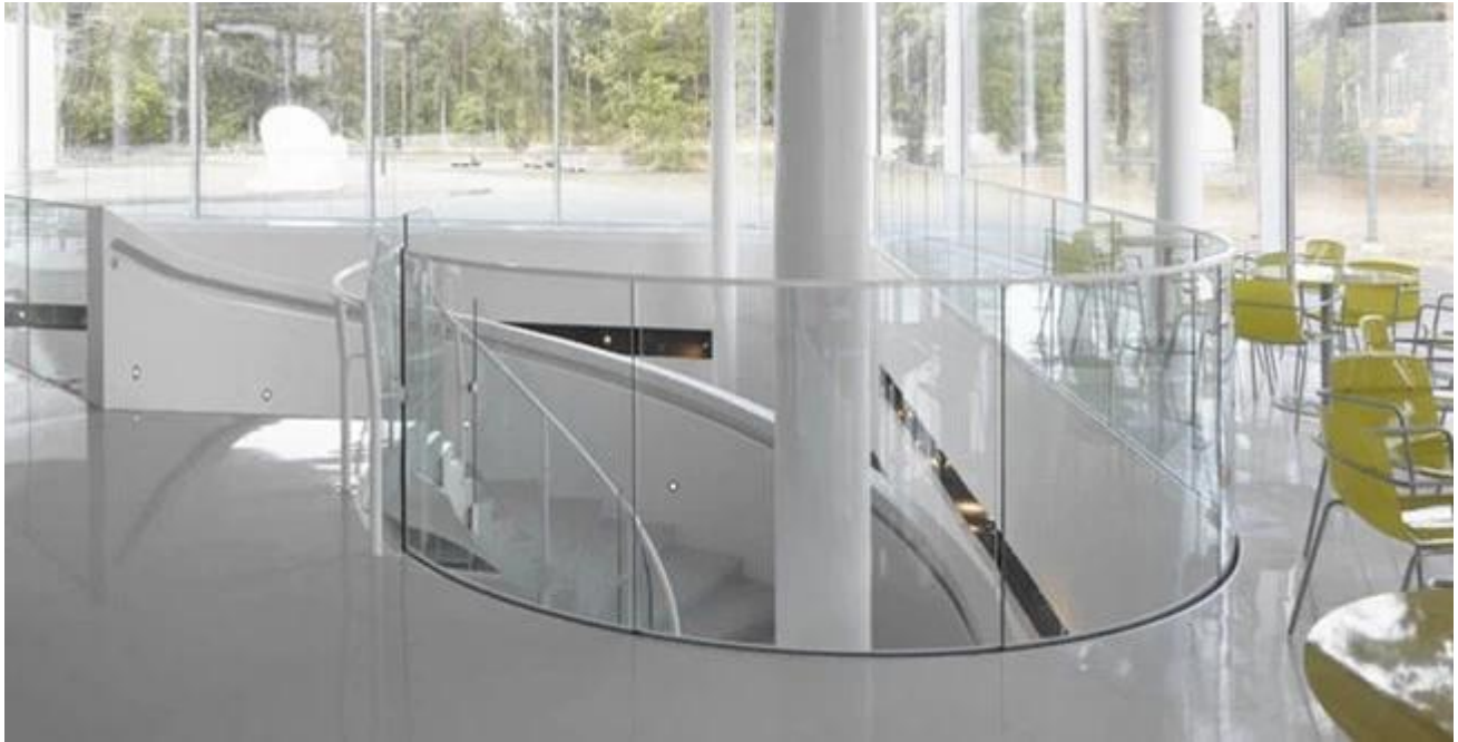
China Curved Tempered Glass Machine