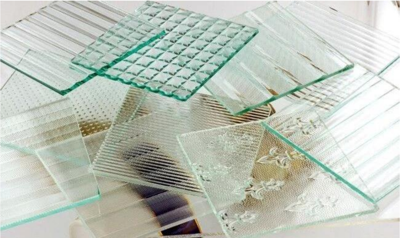
4mm Clear Diamond Patterned Glass: