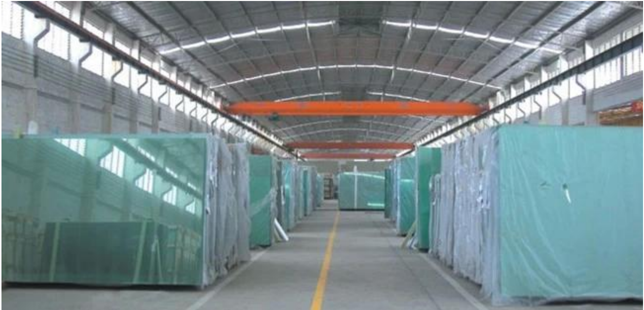
Safety Packaging of Jimmy Glass Factory: