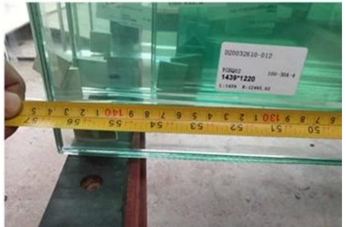
Glass safety packing and loading