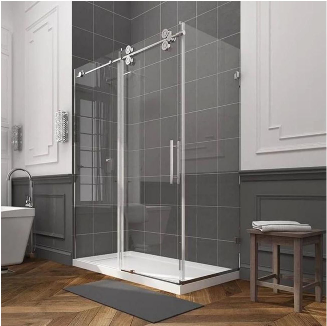
Tempered laminated glass curved and flat bathroom enclosure: