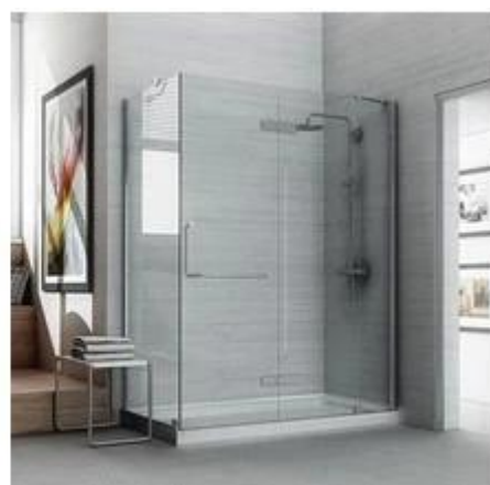
Pattern glass and acid-etched laminated glass shower door: