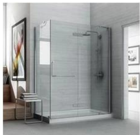
Pattern glass and acid-etched laminated glass shower door: