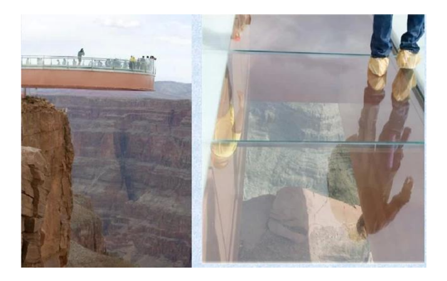
Low Temperature Performance of SGP laminated glass