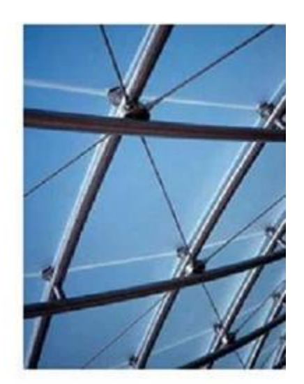
Schubert Club Heilmaier Memorial Bandstand, Minnesota