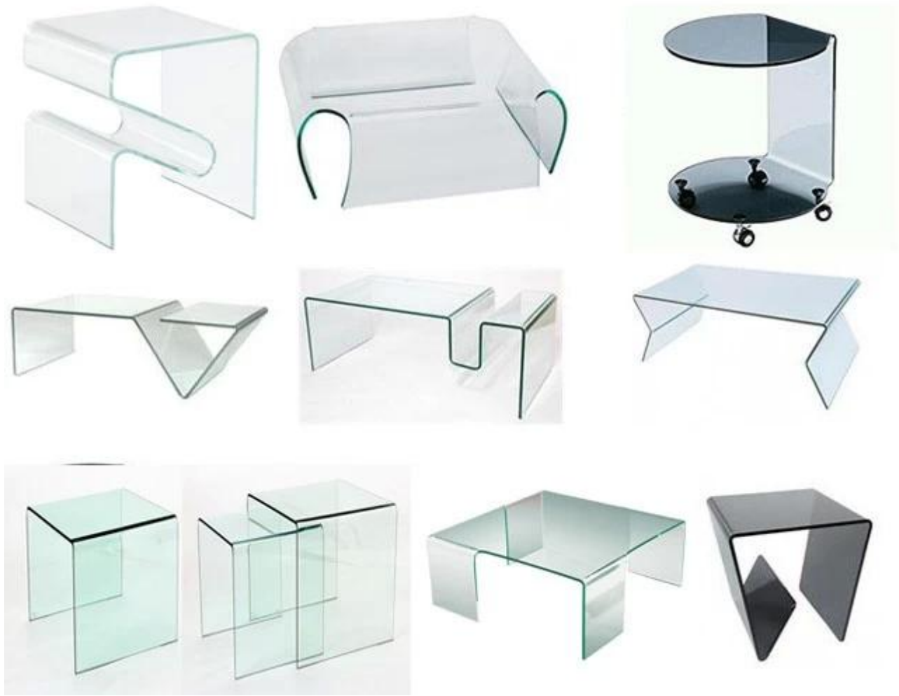
Applications of bent curved glass