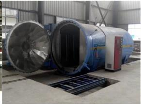
Figure 2: A large industrial machine, possibly a lathe or mill, with a large, circular opening. The machine is blue and white, and is situated in a factory environment.