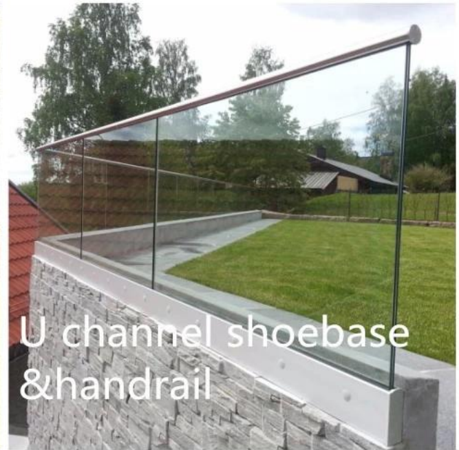
U channel shoebase & handrail