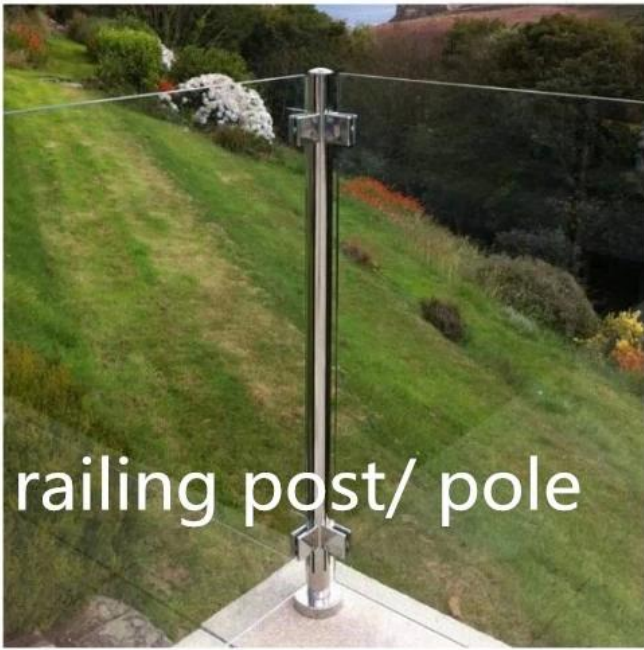
railing post/ pole