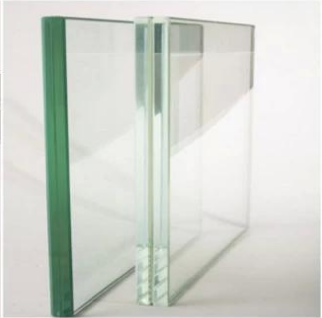
Tempered Laminated Glass Production Plant