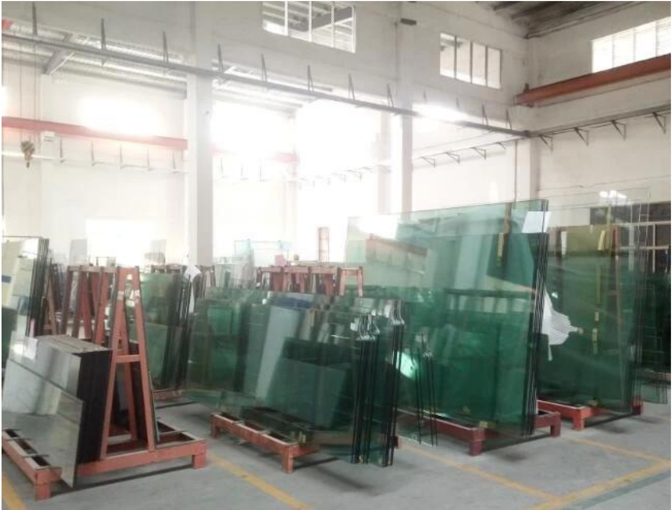
Heat soaked tempered glass manufacturer china