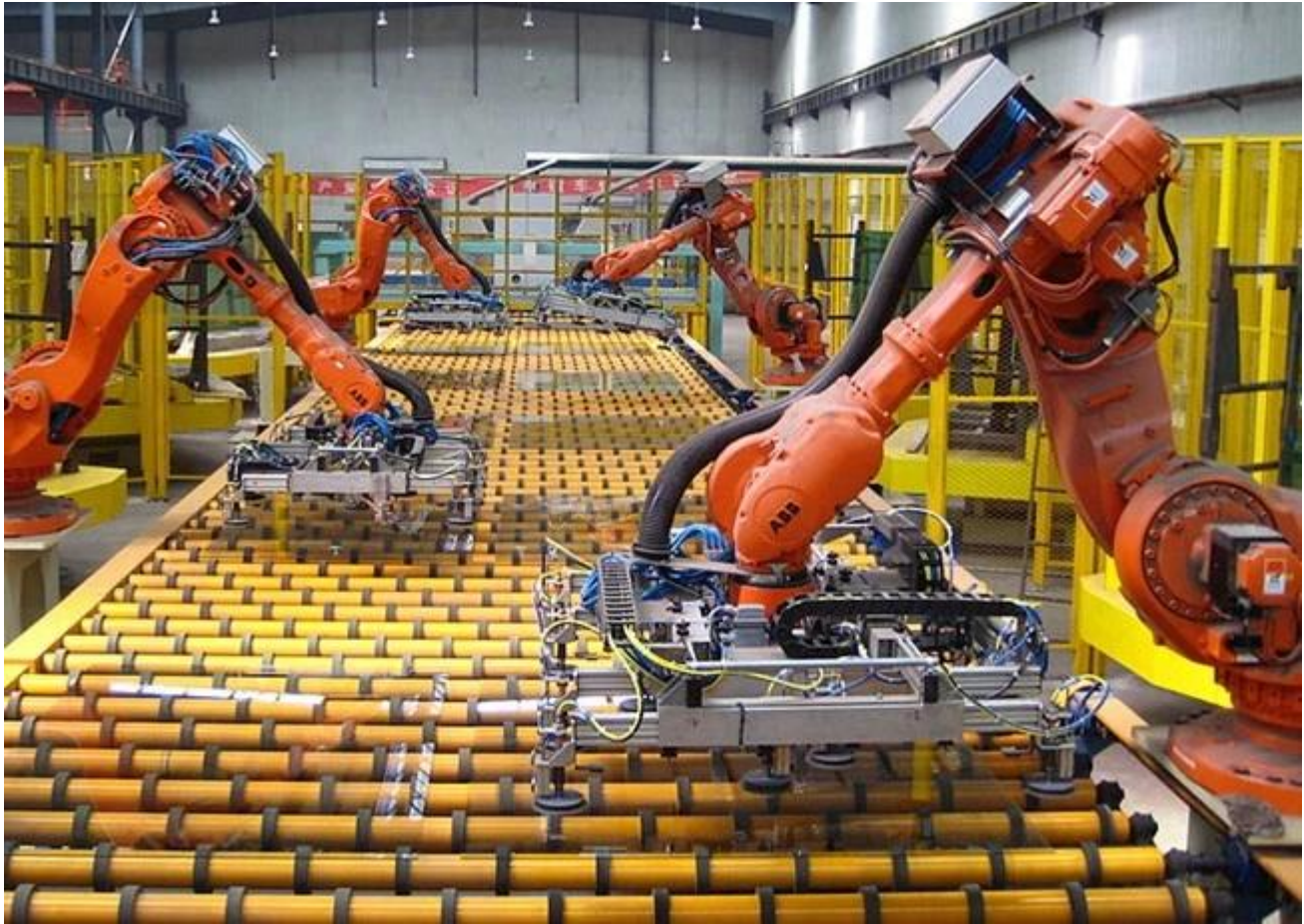
Low Iron Float Glass Warehouse