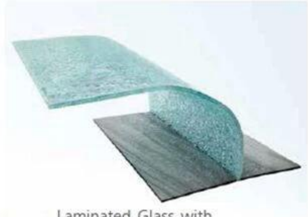
Laminated Glass with PVB Interlayer