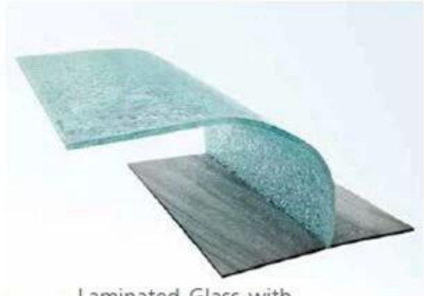
Laminated Glass with PVB Interlayer