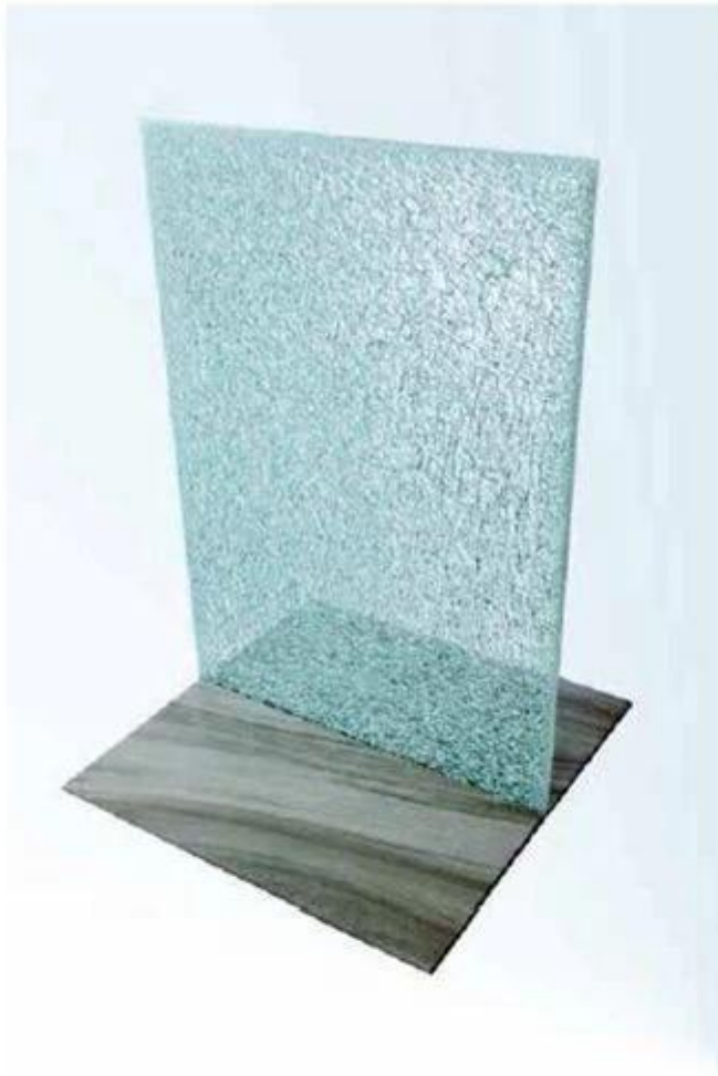
Laminated Glass with SGP Interlayer