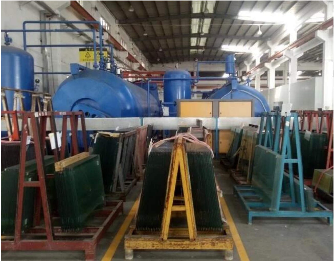
Loading the container by JIMY Glass Factory