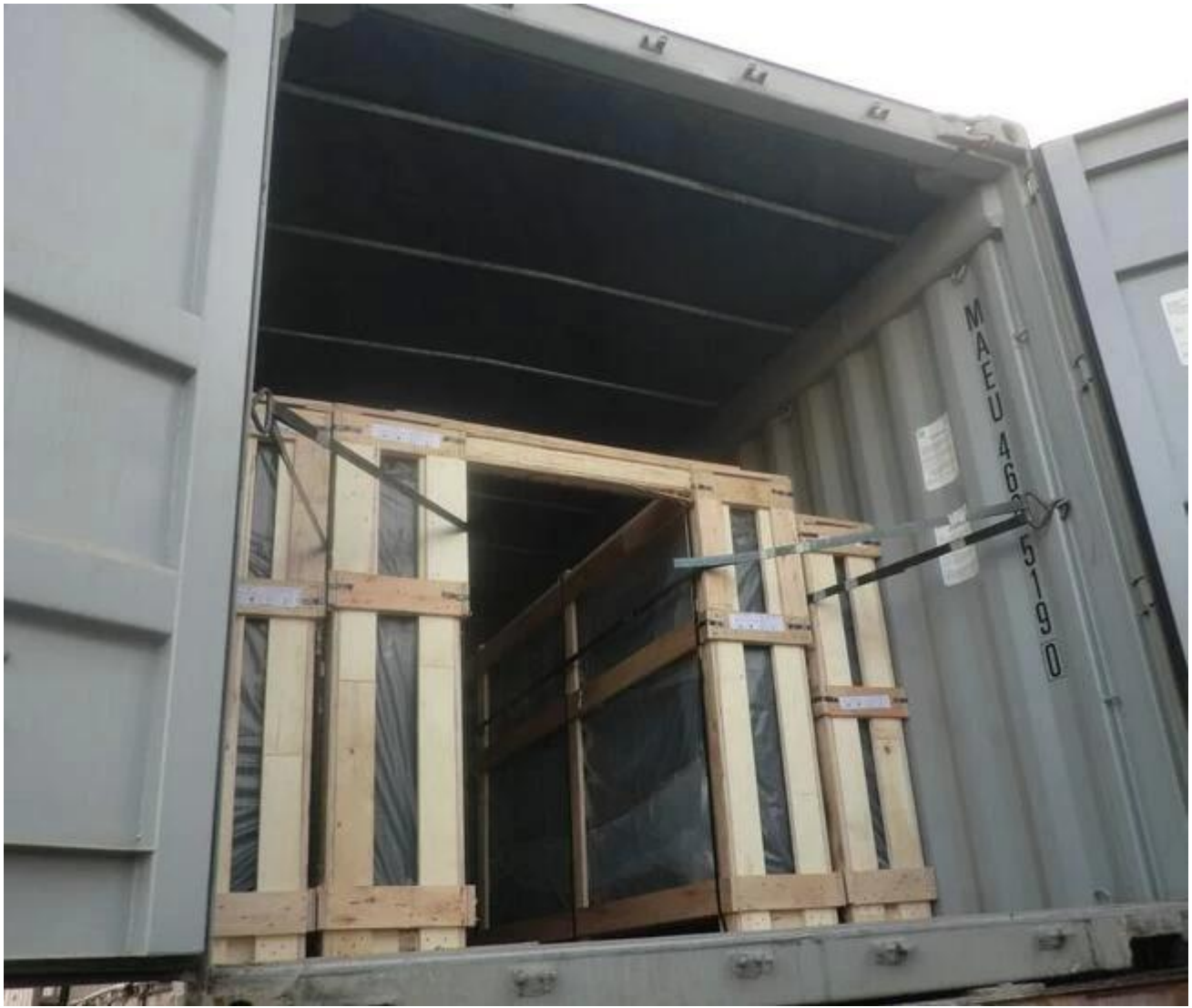
Application of 17.52mm 21.52mm Heat Soaked Laminated Glass