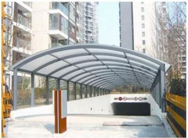
884 curve toughened laminated glass used for floor window and fence: