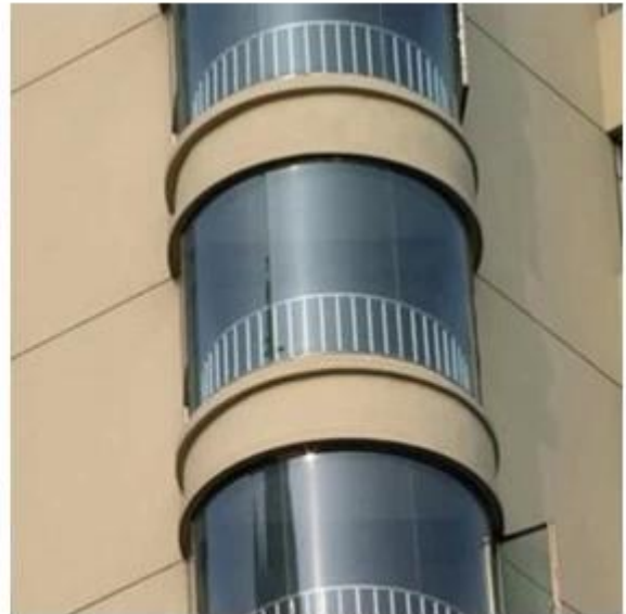
JIMY GLASS COMPANY Safety Packing and Loading for Curved Glass :