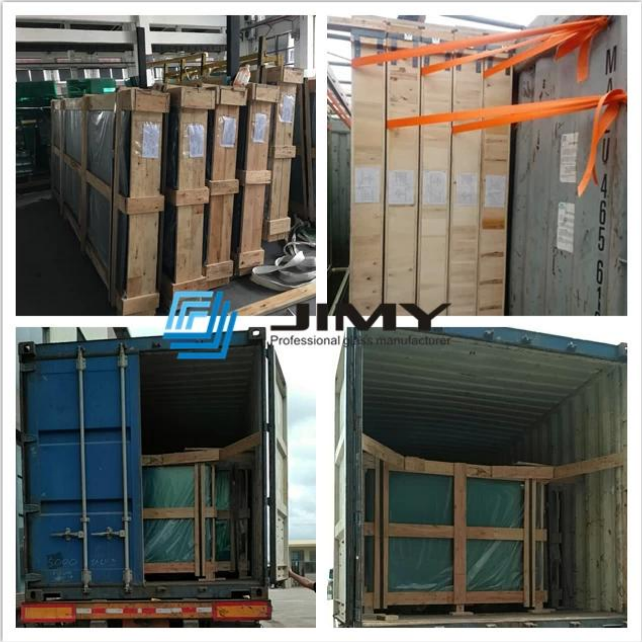
Projects with green laminated glass curtain wall and glass roof,glass dome