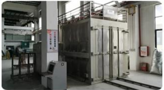
Safety packing and delivery