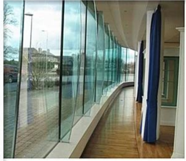
laminated glass facade support fin: