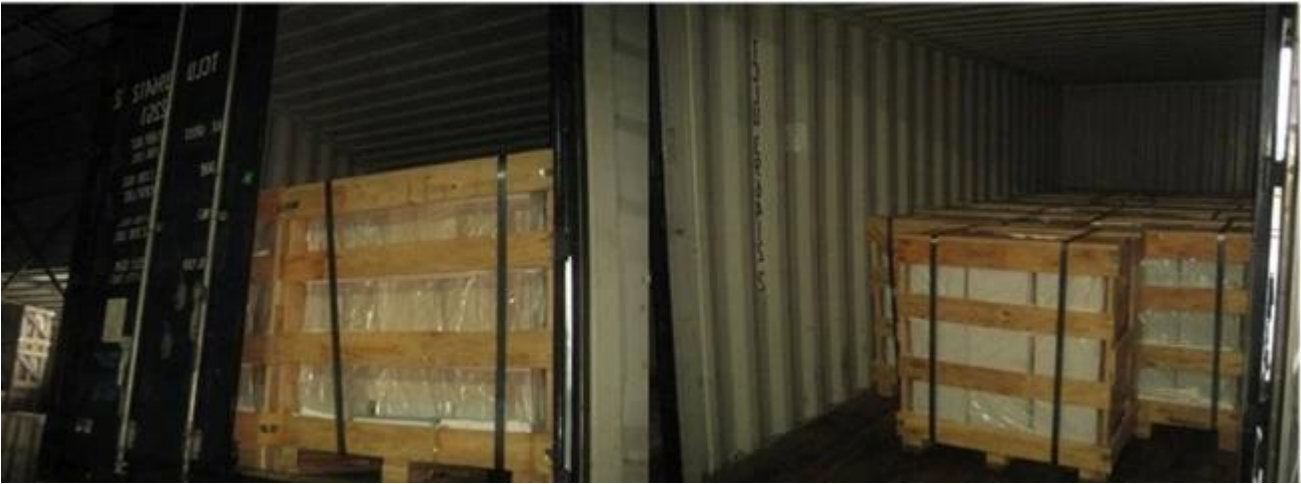
High quality 3mm Anti- reflective glass use on touch screen: