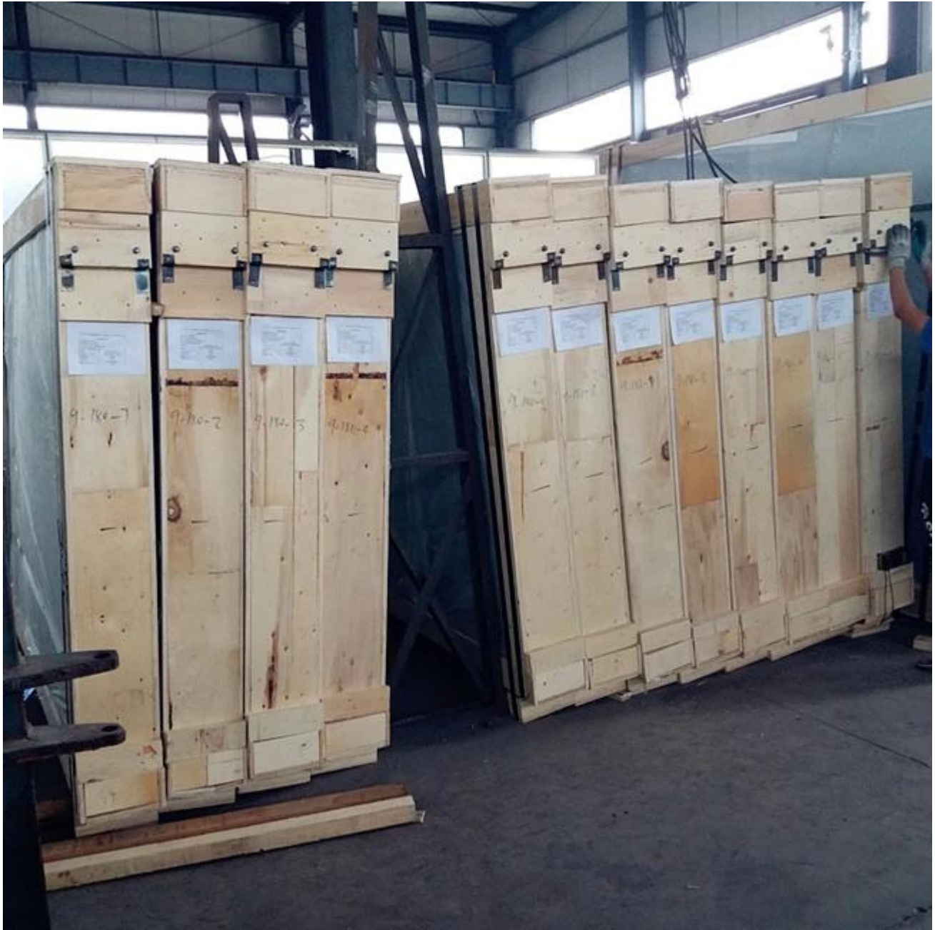
5mm Low-e Glass Safety Loading