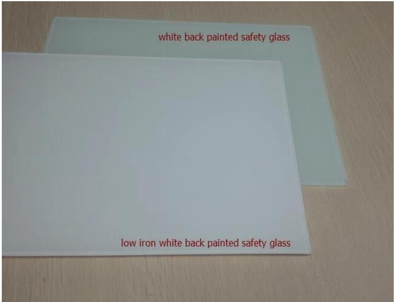
Production line of lacquered glass by Jimmy Glass