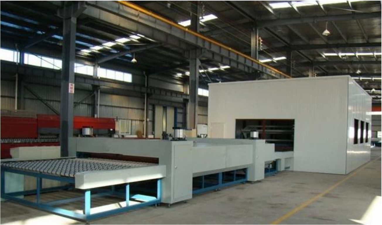
Laminated Glass Autoclave