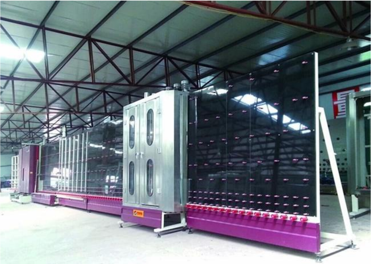
Insulated glass safety loading: