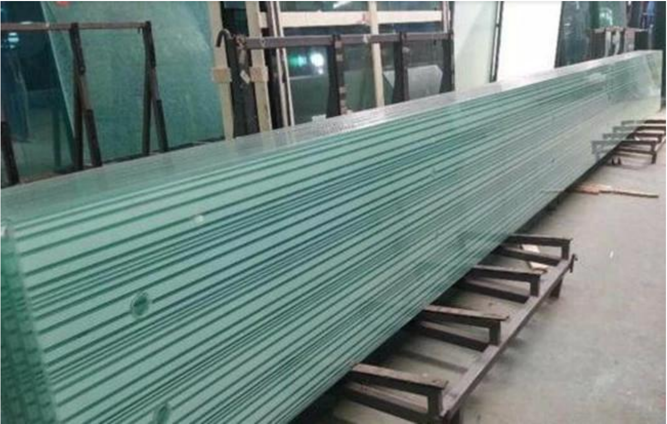
6+6mm Green-Square non-transparent silk screen printed glass used for balustrade