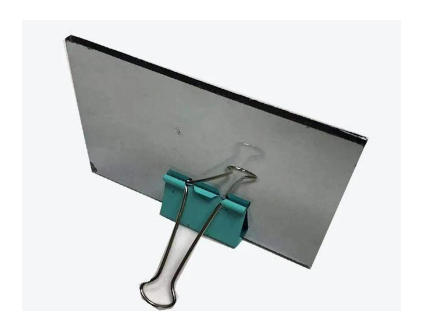
Application for building wall ,Offices,Commercial buildings,home windows